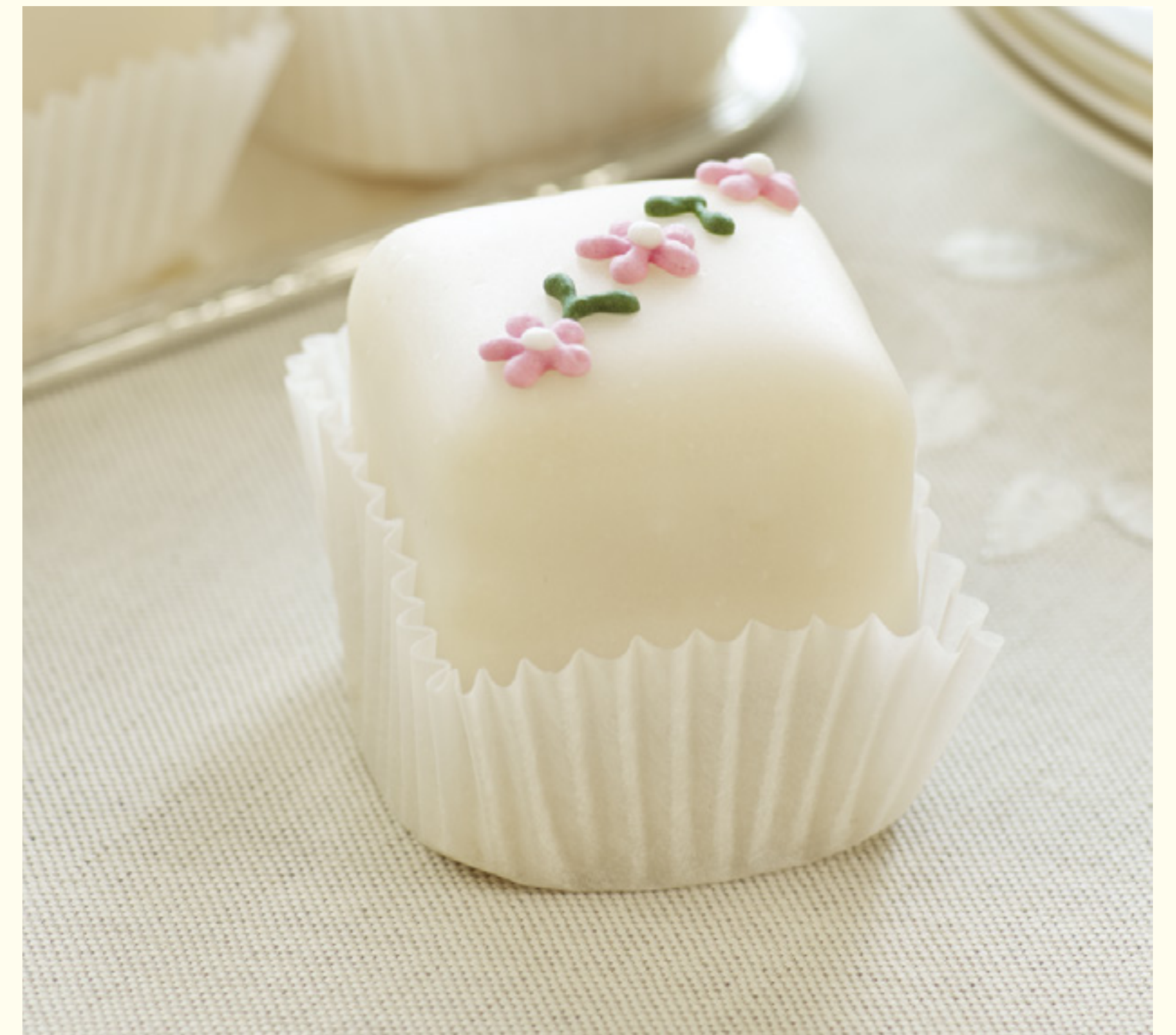
I Three Flowers £3.85 each