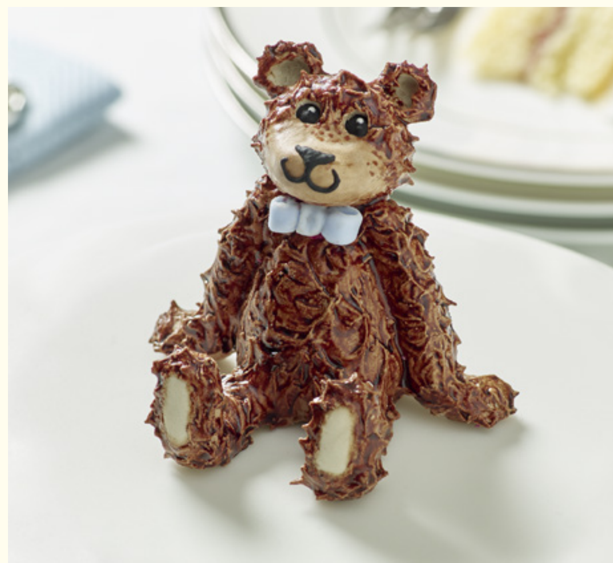
Large Bear with Bow