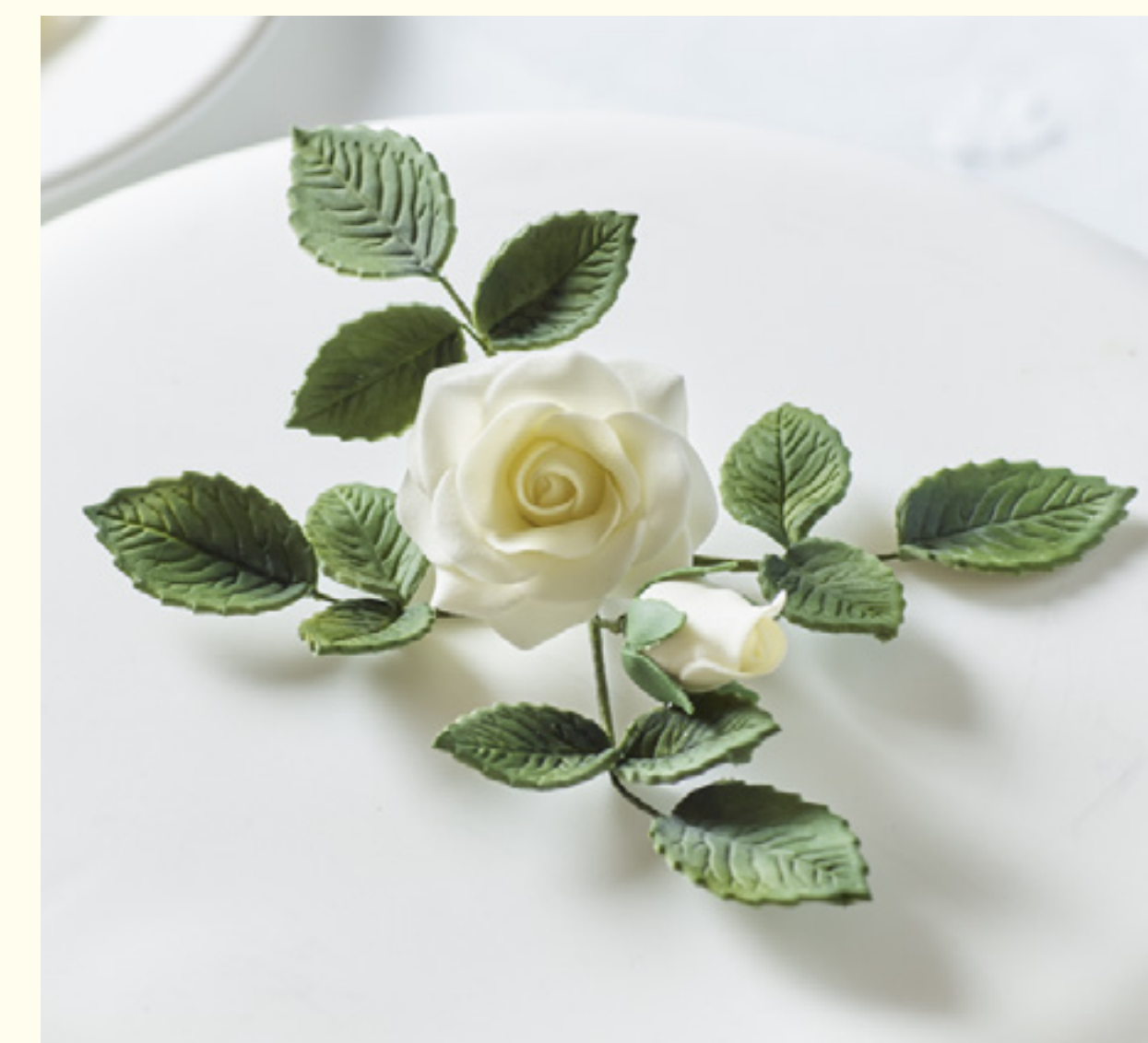
Large Rose Spray