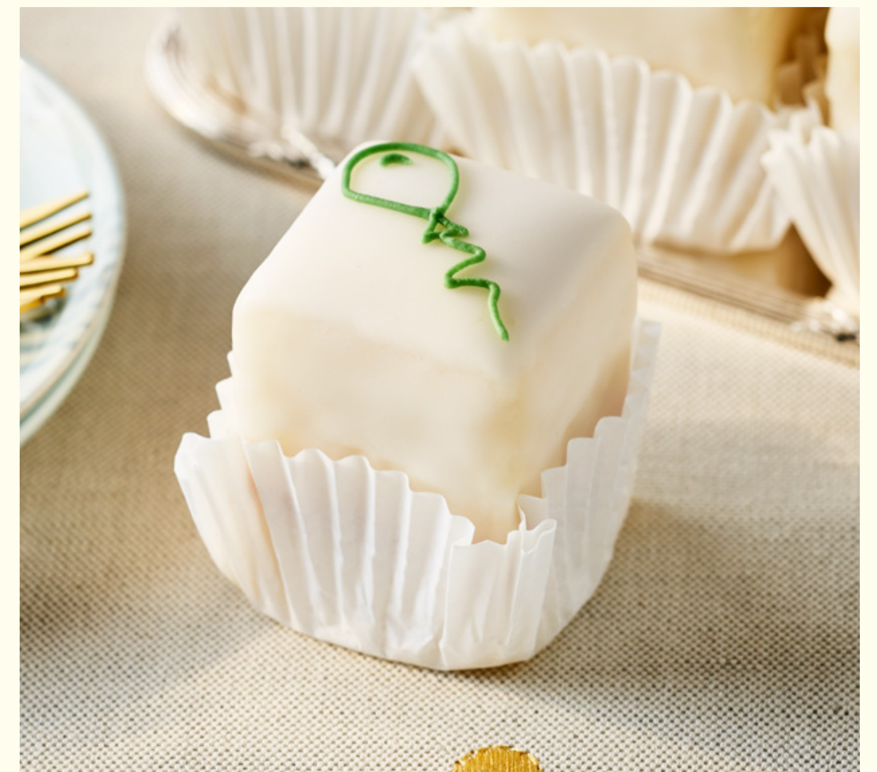
F Balloon £3.25 each