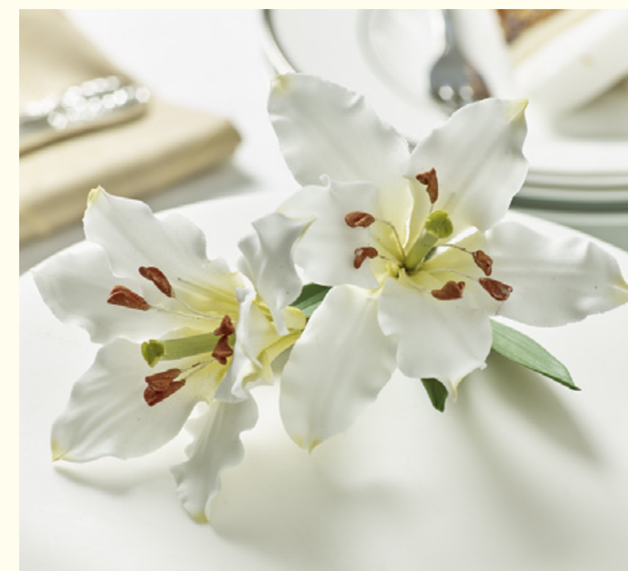
Large Lily Spray