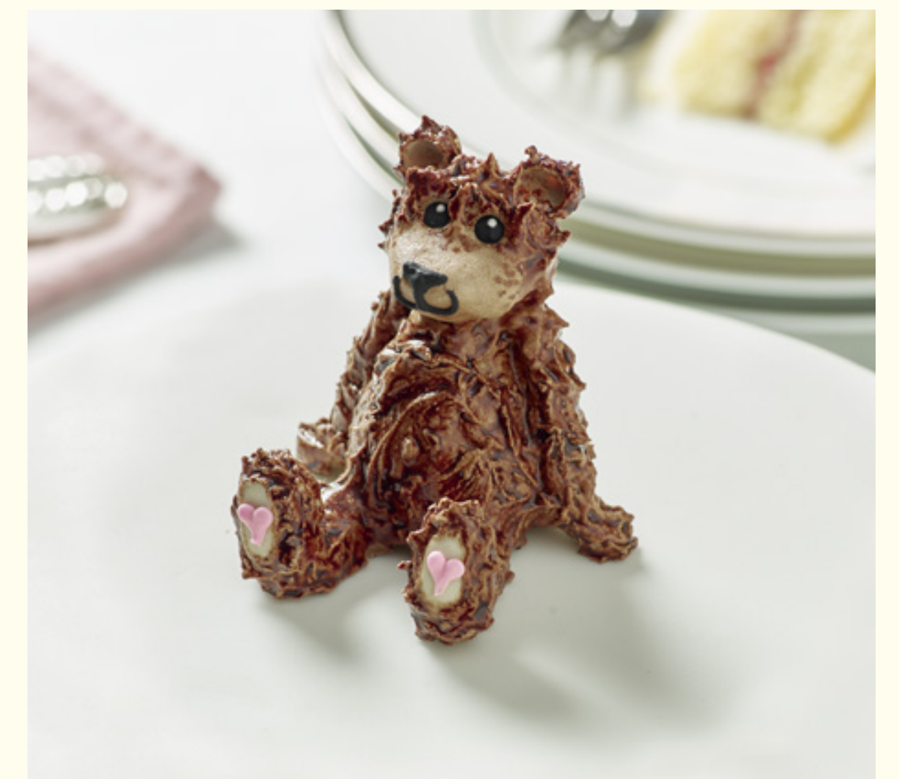
Small Bear with Hearts