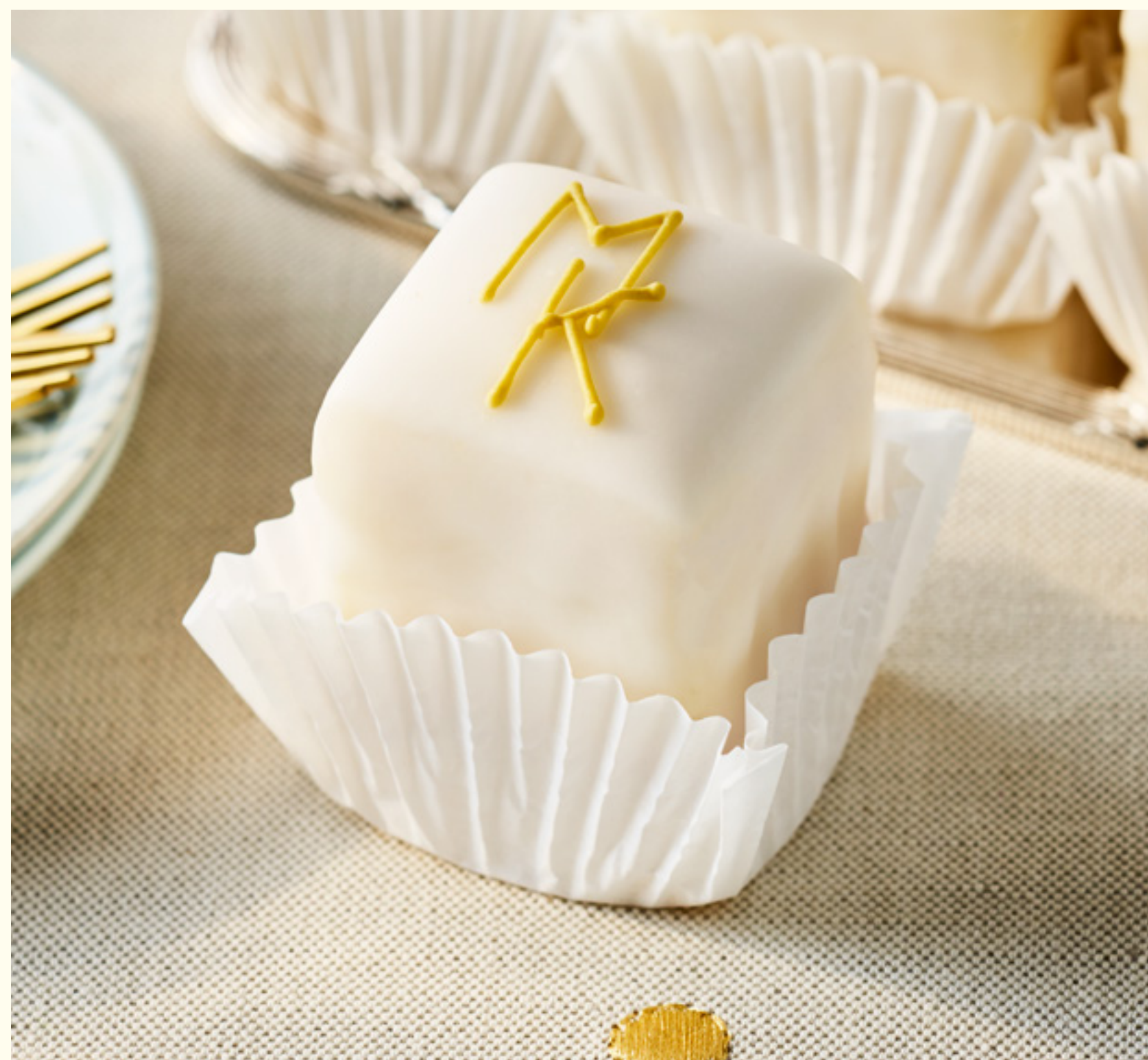
E Monogram £3.25 each