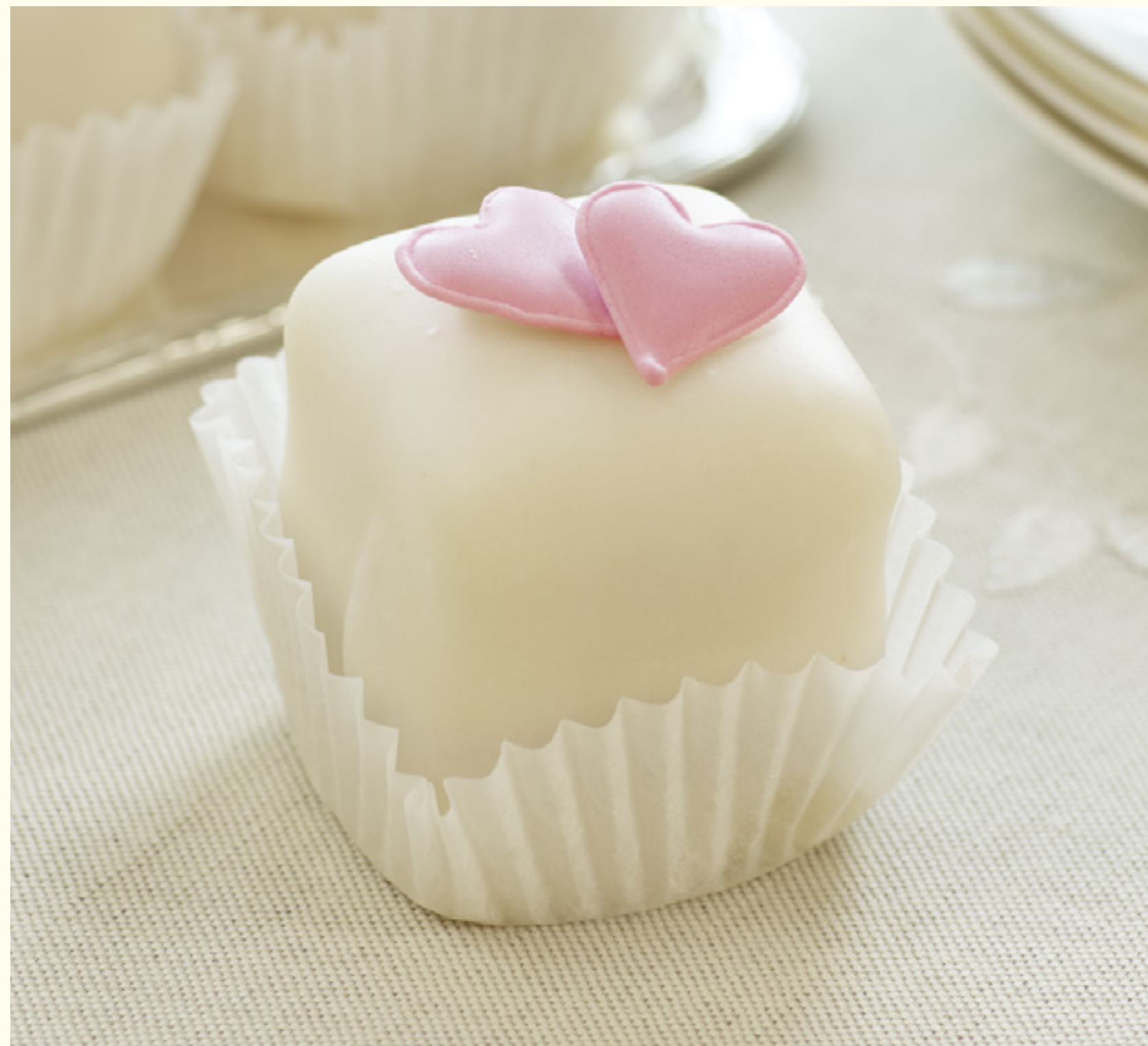
G Two Hearts £3.85 each