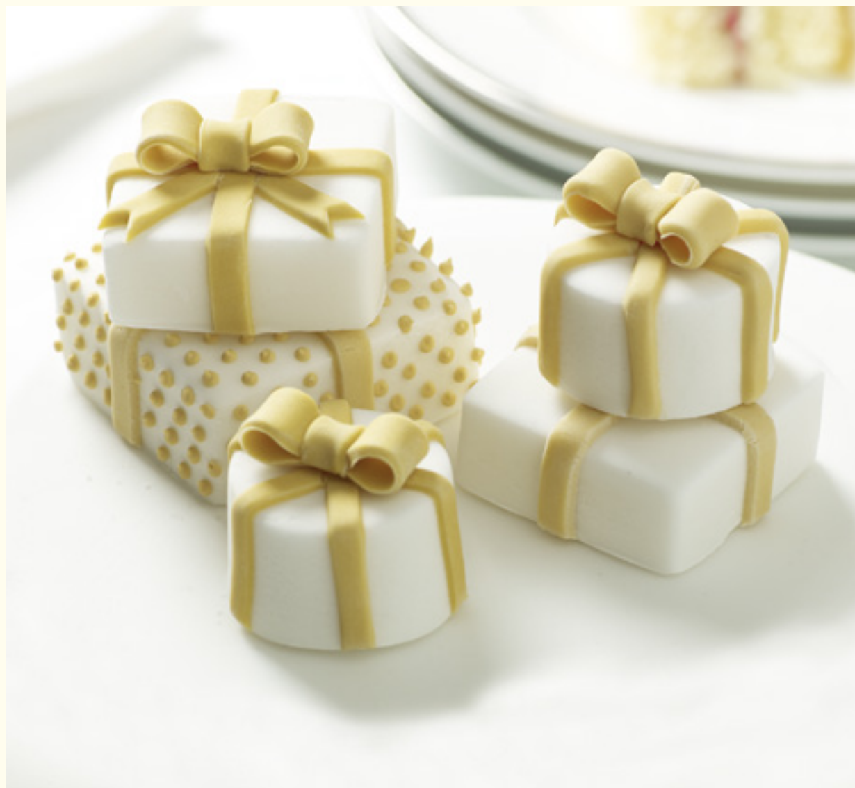
Stack of Five Presents