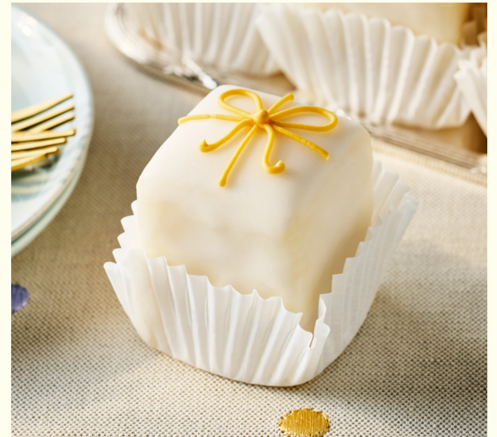
C Parcel £3.25 each