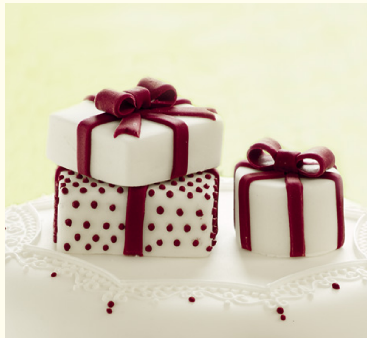
Stack of Three Presents