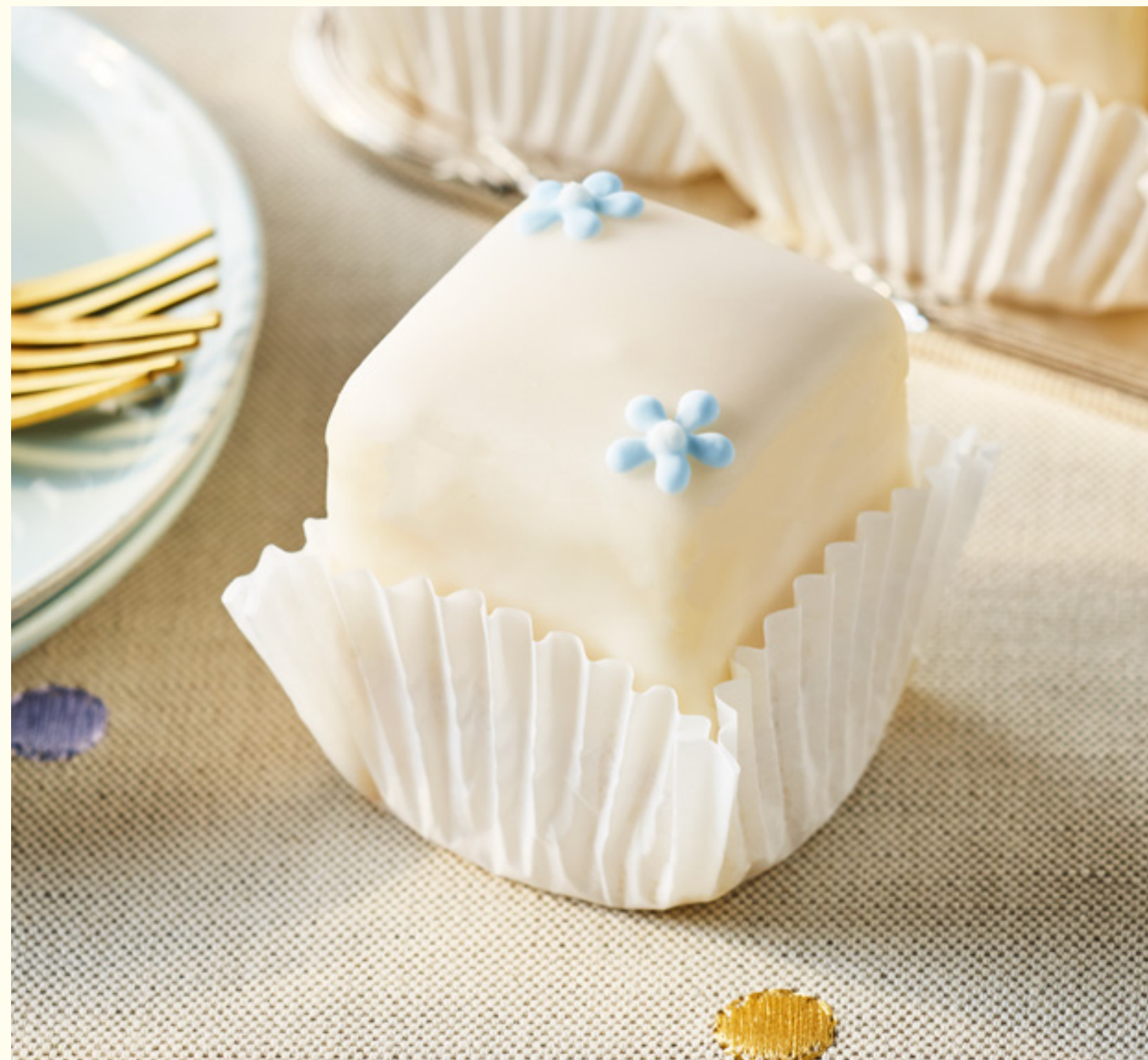
B Classic Flower £3.25 each