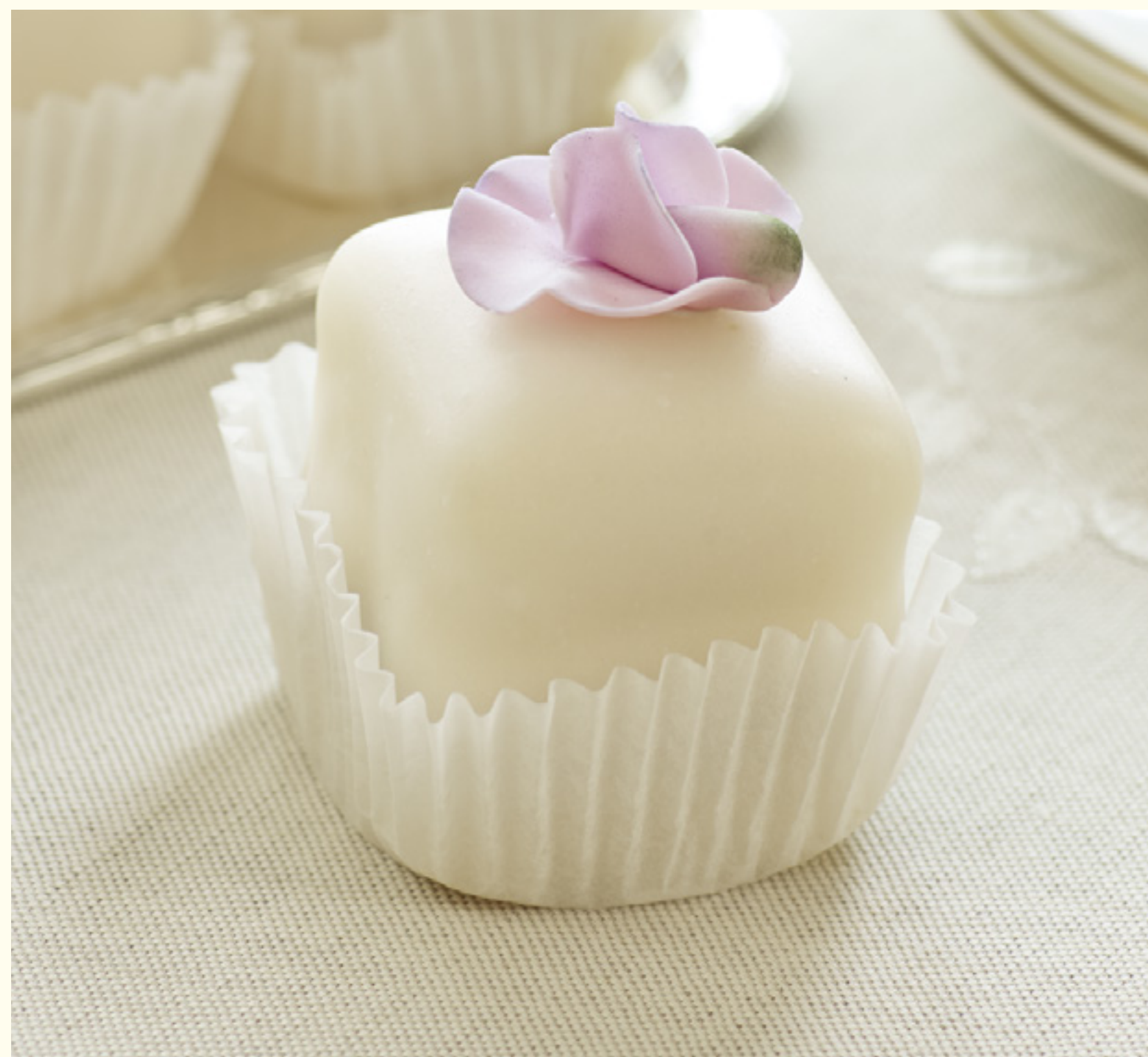
K Sweet Pea £3.85 each