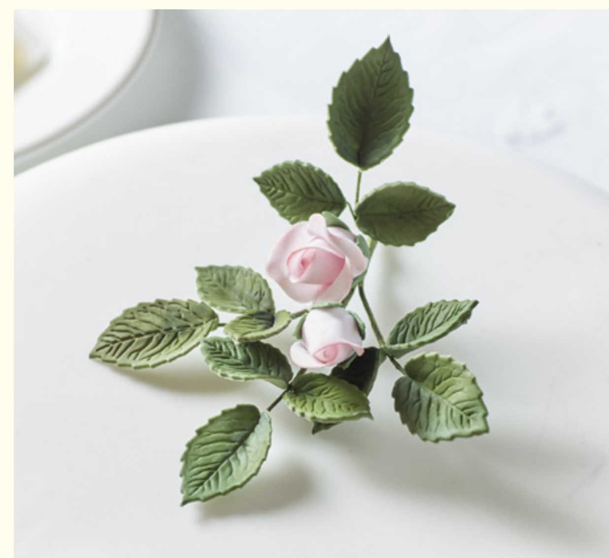
Small Rose Spray