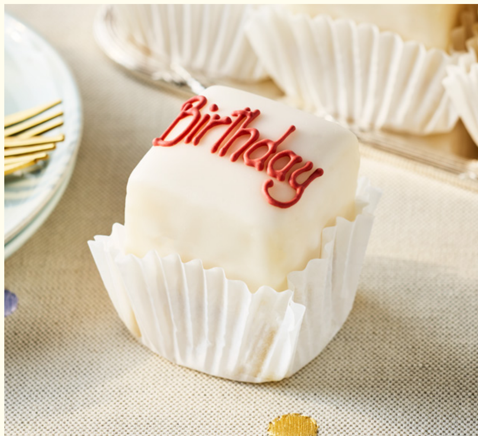
D Personalised £3.25 each