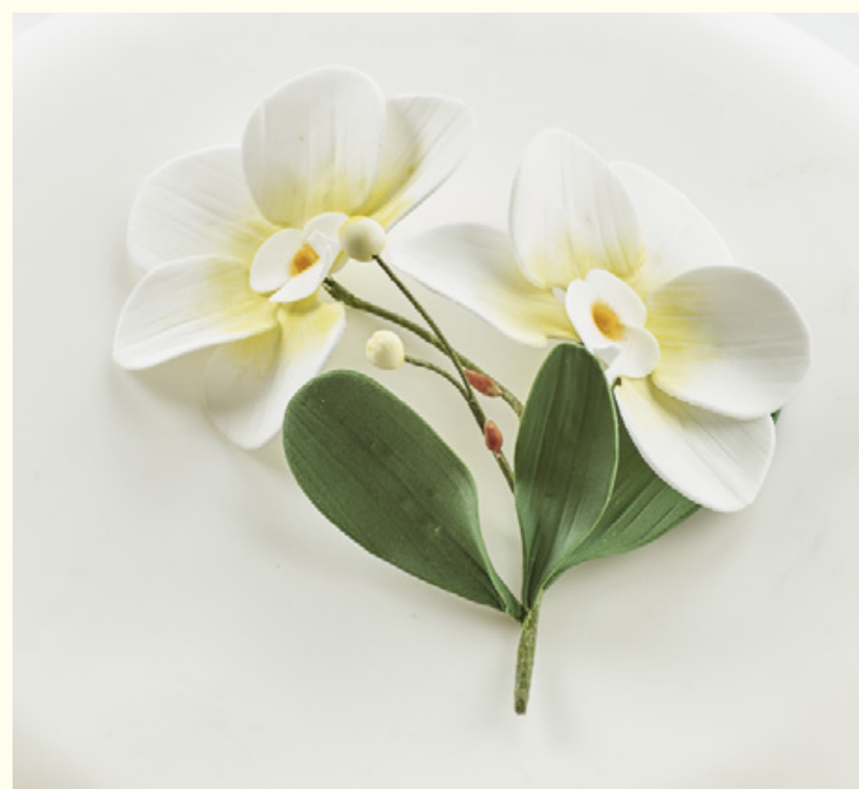
Double Orchid Spray