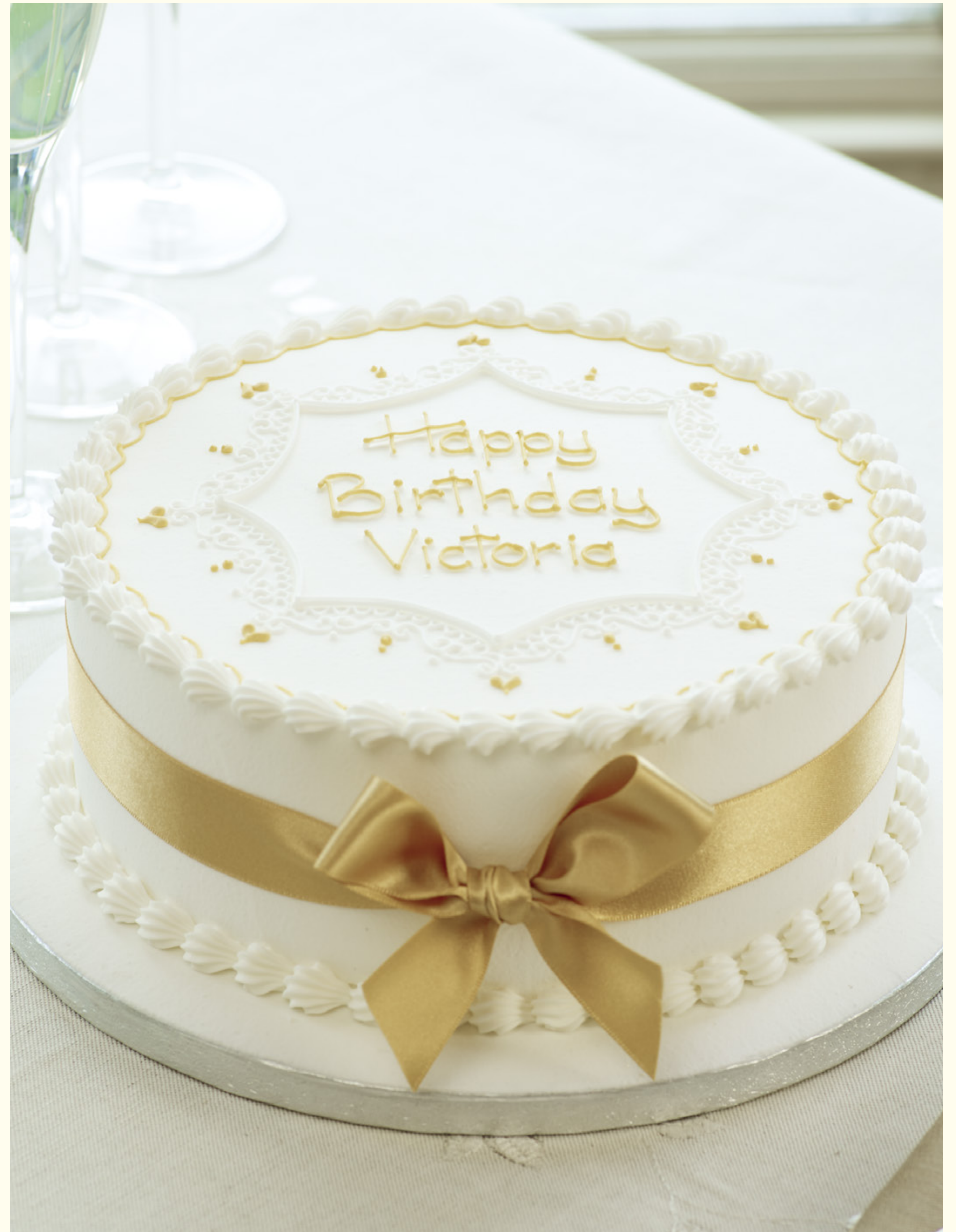
The image shows a Fruit Cake Royal Iced