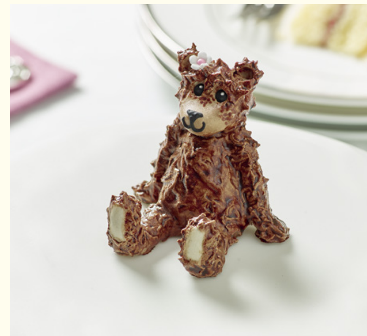
Small Bear with Flower