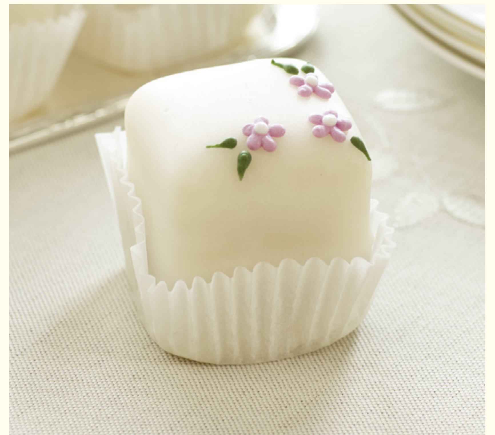
L Three Corner Flowers £3.85 each