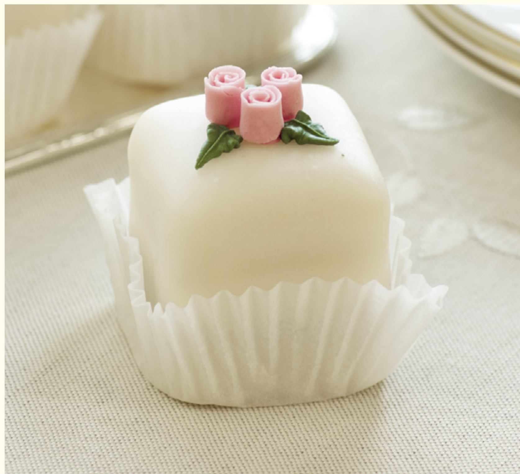
J Three Rosebuds £3.85 each