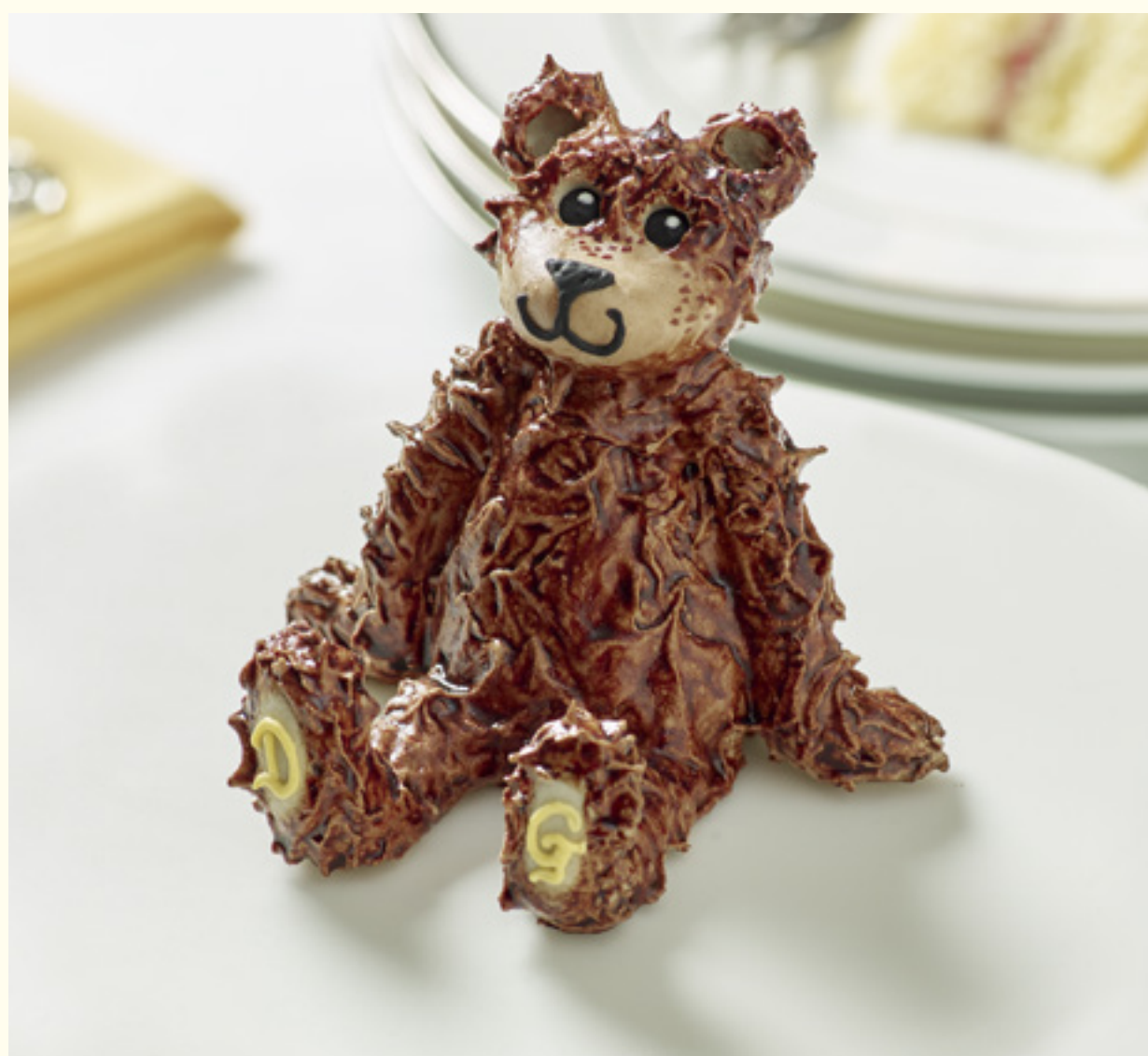
Large Bear with Initials