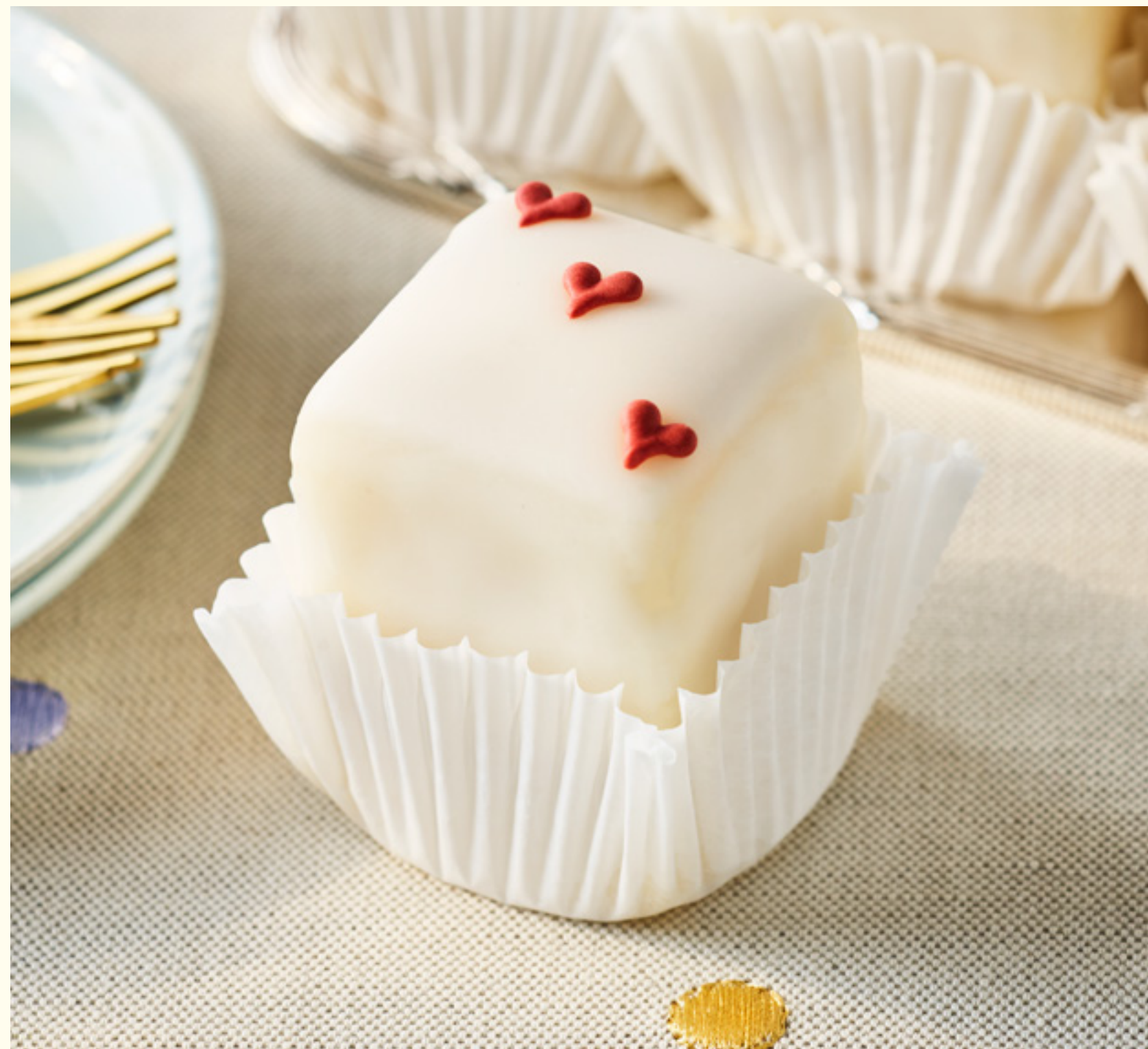
A Three Hearts £3.25 each