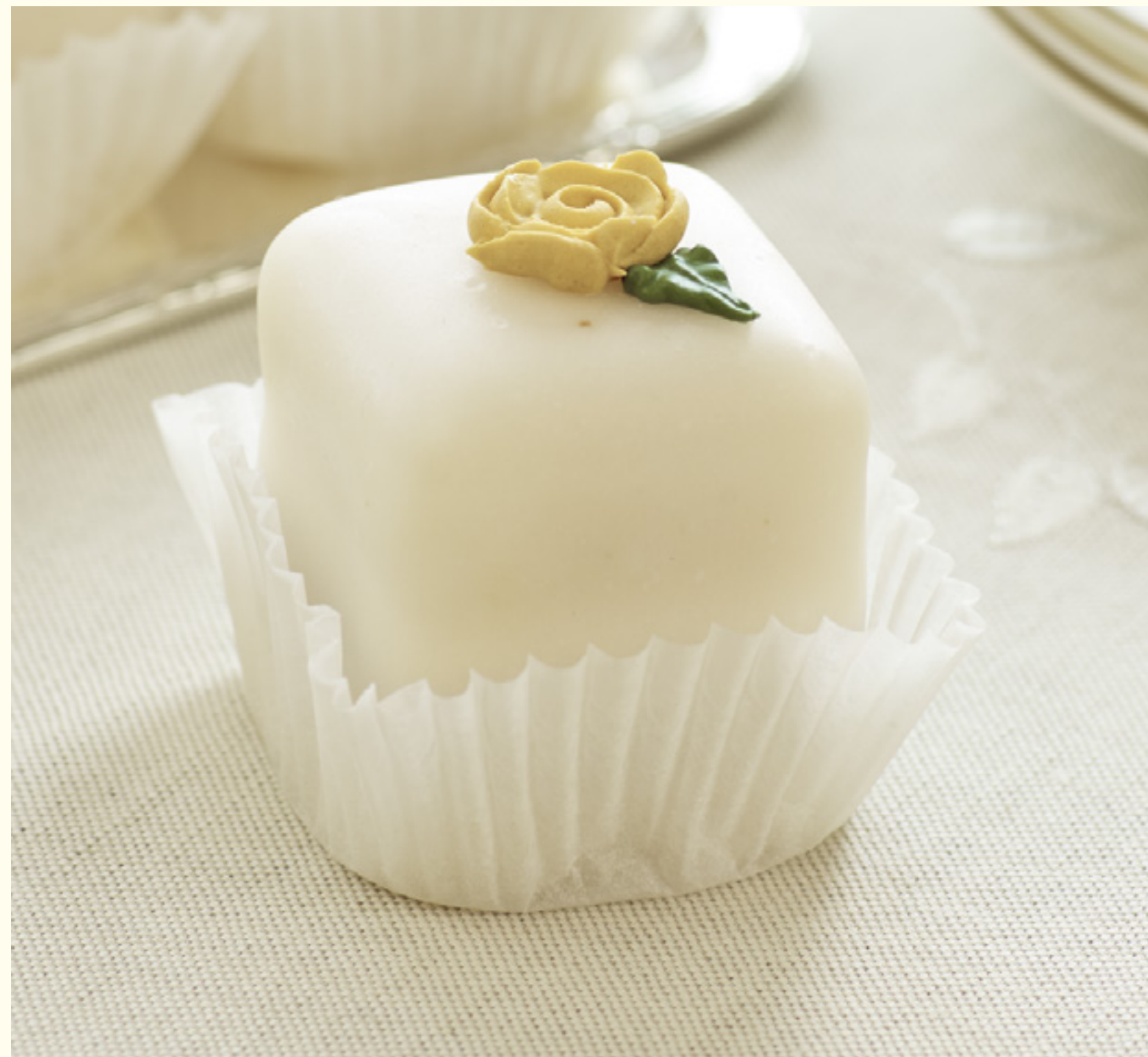
H Single Rose £3.85 each