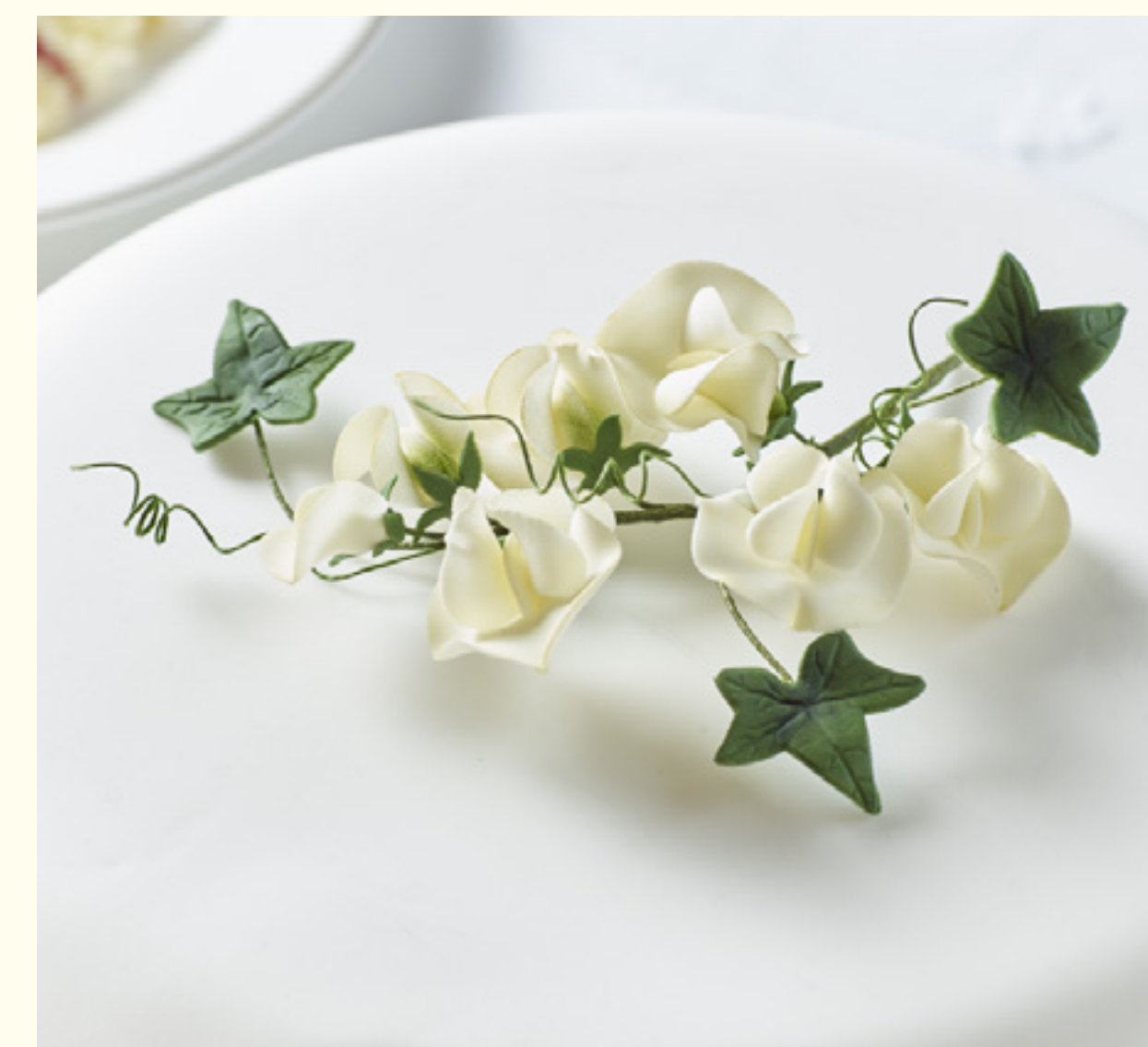
Large Sweet Pea Spray