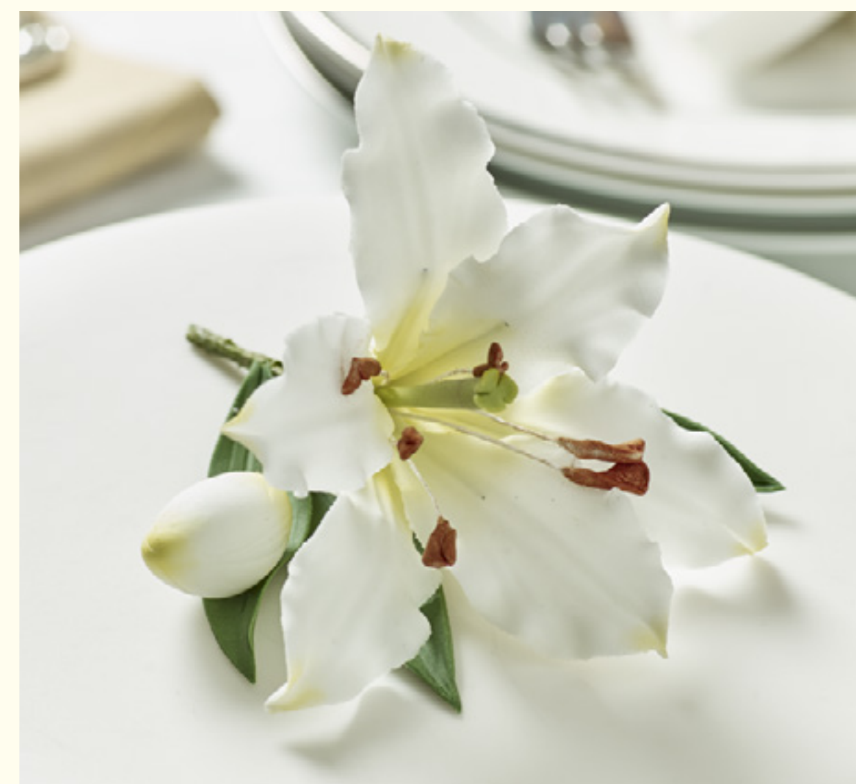
Small Lily Spray