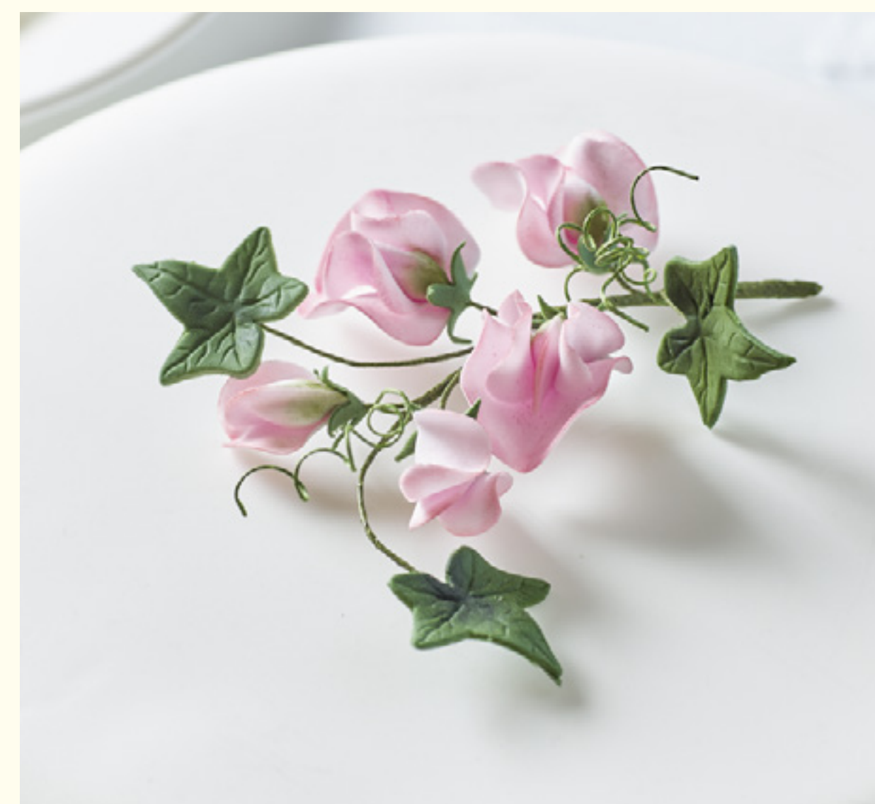
Small Sweet Pea Spray

Our lifelike sugar flowers make a stunning addition to any of our cakes. Skilfully handcrafted, it's hard to believe that they're not real.